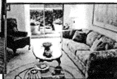
Enjoy your own private apartment furnished with your own favorite pieces