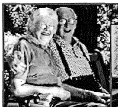
Meet new friends in our flower-filled patio