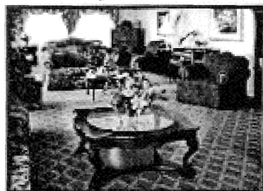
Family and friends are always welcome in our large inviting lounge