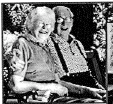
Meet new friends in our flower-filled patio