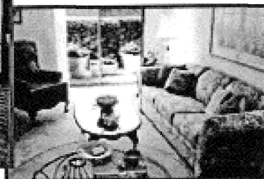
Enjoy your own private apartment furnished with your own favorite pieces