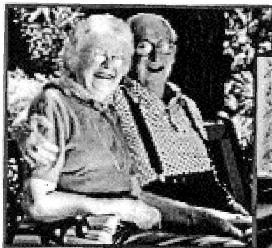
Meet new friends in our flower-filled patio