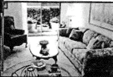
Enjoy your own private apartment furnished with your own favorite pieces