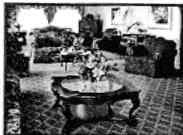
Family and friends are always welcome in our large inviting lounge