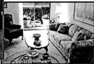
Enjoy your own private apartment furnished with your own favorite pieces