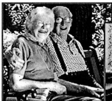
Meet new friends in our flower-filled patio