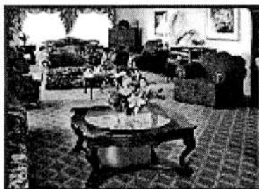
Family and friends are always welcome in our large inviting lounge