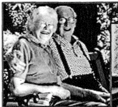
Meet new friends in our flower-filled patio