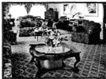
Family and friends are always welcome in our large inviting lounge