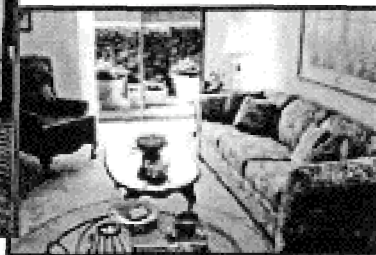
Enjoy your own private apartment furnished with your own favorite pieces