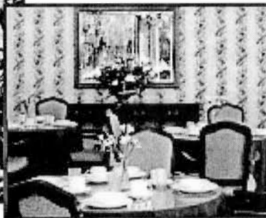
Beautifully appointed dining room serving tasty, nourishing meals