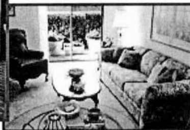
Enjoy your own private apartment furnished with your own favorite pieces