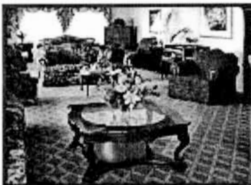
Family and friends are always welcome in our large inviting lounge