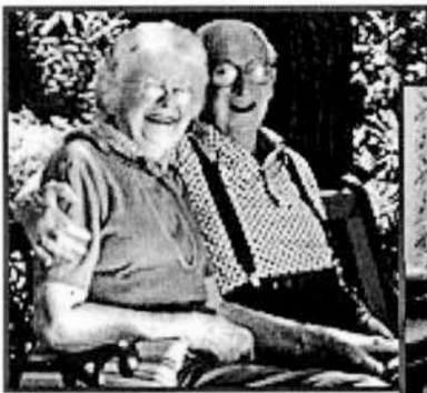
Meet new friends in our flower-filled patio