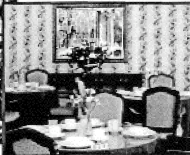
Beautifully appointed dining room serving tasty, nourishing meals