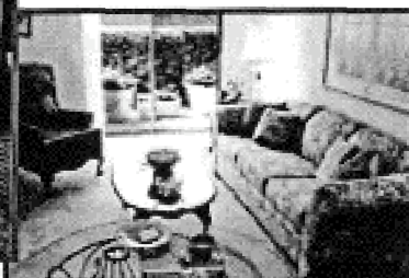
Enjoy your own private apartment furnished with your own favorite pieces