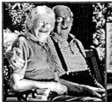
Meet new friends in our flower-filled patio