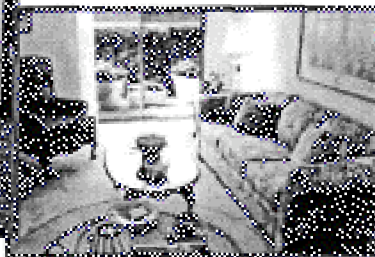
Enjoy your own private apartment furnished with your own favorite pieces