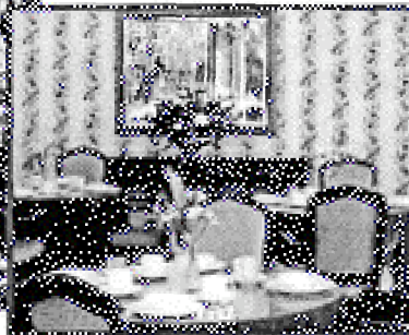
Beautifully appointed dining room serving tasty, nourishing meals