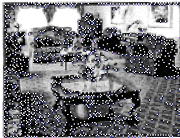
Family and friends are always welcome in our large inviting lounge