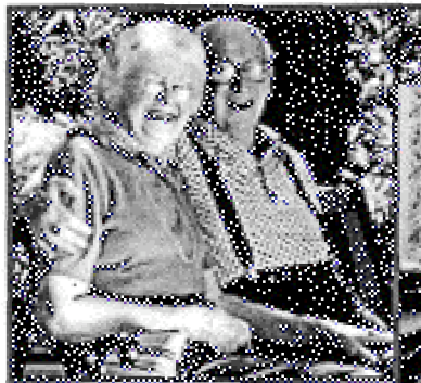
Meet new friends in our flower-filled patio