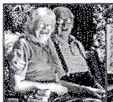
Meet new friends in our flower-filled patio