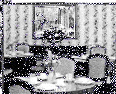
Beautifully appointed dining room serving tasty, nourishing meals