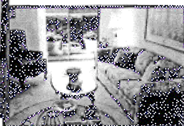
Enjoy your own private apartment furnished with your own favorite pieces