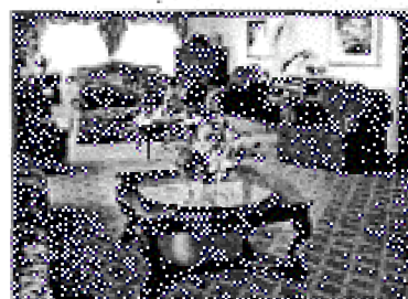
Family and friends are always welcome in our large inviting lounge