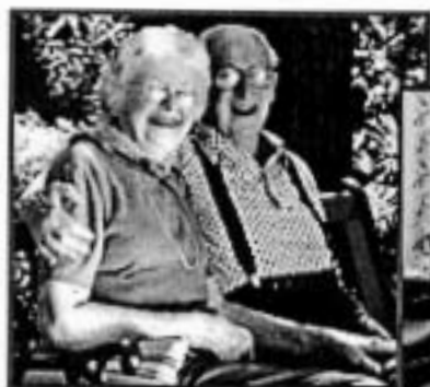
Meet new friends in our flower-filled patio