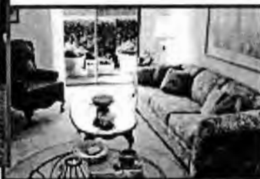
Enjoy your own private apartment furnished with your own favorite pieces