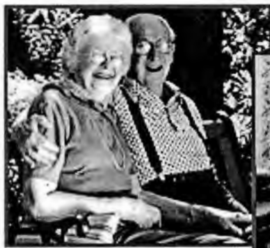
Meet new friends in our flower-filled patio