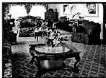
Family and friends are always welcome in our large inviting lounge