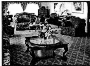
Family and friends are always welcome in our large inviting lounge