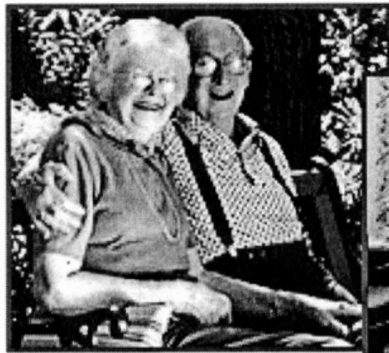
Meet new friends in our flower-filled patio