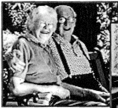
Meet new friends in our flower-filled patio