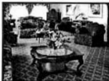
Family and friends are always welcome in our large inviting lounge