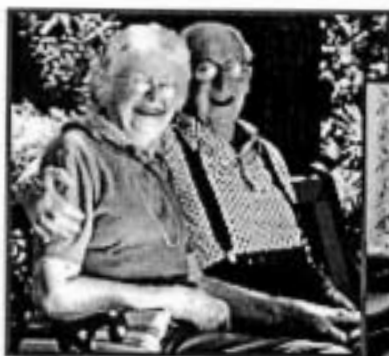
Meet new friends in our flower-filled patio