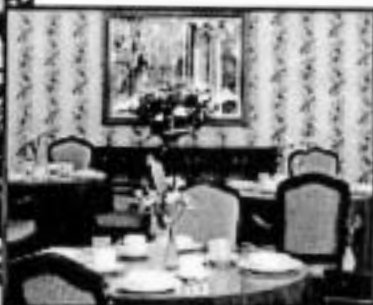
Beautifully appointed dining room serving tasty, nourishing meals