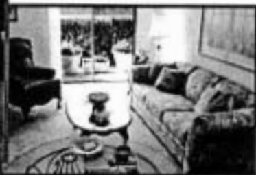
Enjoy your own private apartment furnished with your own favorite pieces