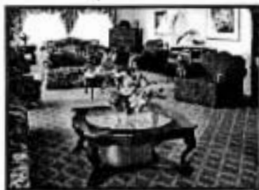
Family and friends are always welcome in our large inviting lounge