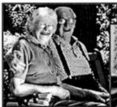
Meet new friends in our flower-filled patio