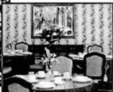
Beautifully appointed dining room serving tasty, nourishing meals