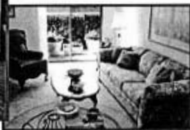
Enjoy your own private apartment furnished with your own favorite pieces