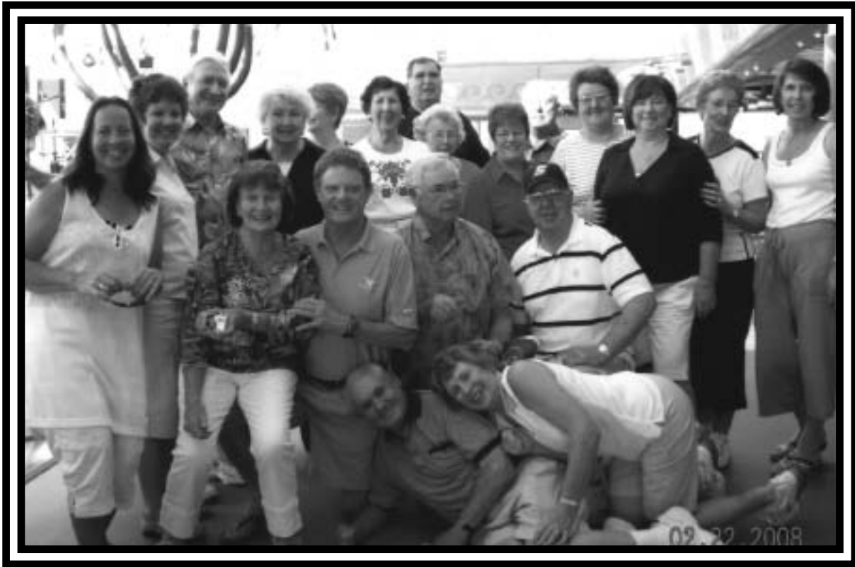
Irish Cruise, February 2008