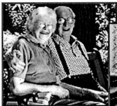
Meet new friends in our flower-filled patio