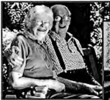
Meet new friends in our flower-filled patio