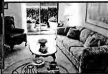
Enjoy your own private apartment furnished with your own favorite pieces