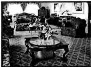
Family and friends are always welcome in our large inviting lounge