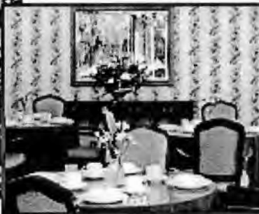
Beautifully appointed dining room serving tasty, nourishing meals