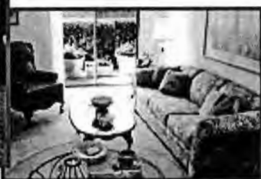
Enjoy your own private apartment furnished with your own favorite pieces