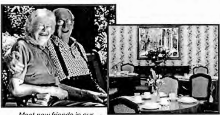
Meet new friends in our flower-filled patio