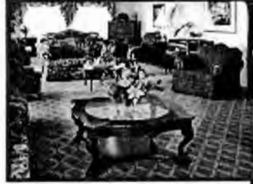
Family and friends are always welcome in our large inviting lounge