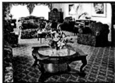
Family and friends are always welcome in our large inviting lounge