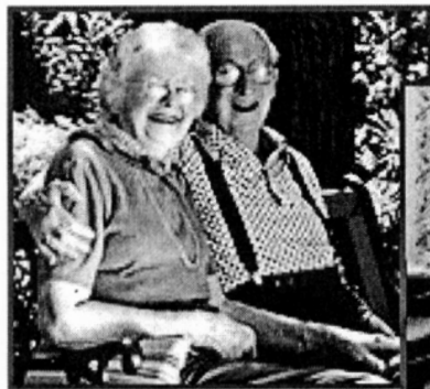
Meet new friends in our flower-filled patio