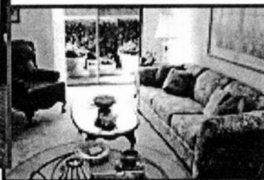
Enjoy your own private apartment furnished with your own favorite pieces