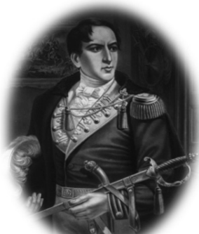
ROBERT EMMET IRISH ORATOR AND PATRIOT

Group Bookings & information 415/860-1854