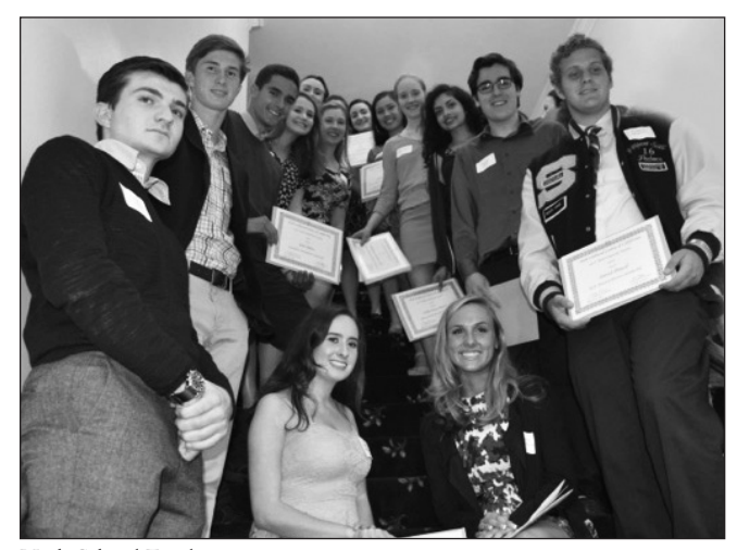
High School Finalists