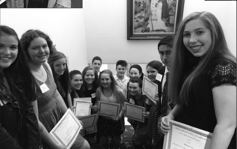
8th Grade Finalists