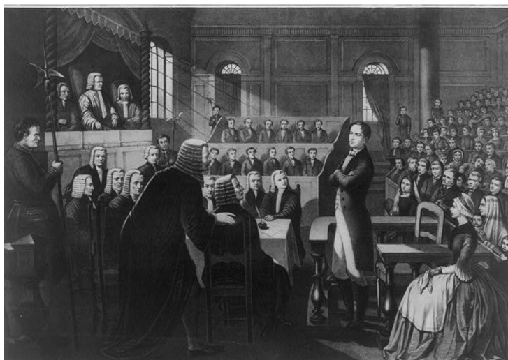
Trial of Robert Emmet

September 17, 2017 12:00 pm Band Concourse Golden Gate Park