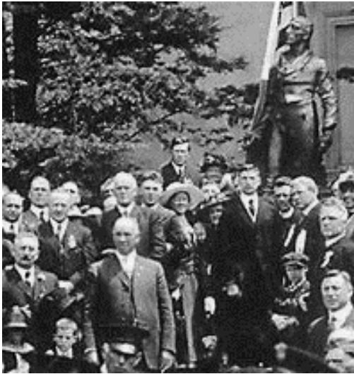
EAMON DE VALERA UNVEILING STATUE IN GOLDEN GATE PARK 1919

Join the United Irish Societies of San Francisco in Honoring the Irish Patriot, Robert Emmet on the 100 th Anniversary of the Dedication of his Statue