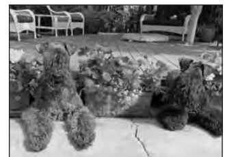
Two resting in the flowers!

• Top Champion AKC bloodlines • Hypoallergenic • Health tested • Family Friendly • Excellent Alarm Dog The Kerry Blue Terrier was designated part of the Irish National Inventory of Intangible Cultural Heritage by the Department of Culture, Heritage and the Gaeltacht in July 2019.