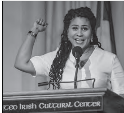
San Francisco Mayor London Breed encourages the audience to rebuild the Irish Center.