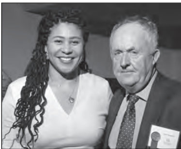
Mayor London Breed with Joe Cassidy