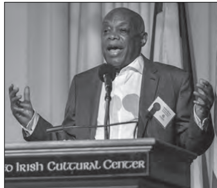
Former Mayor Willie Brown addresses the audience.