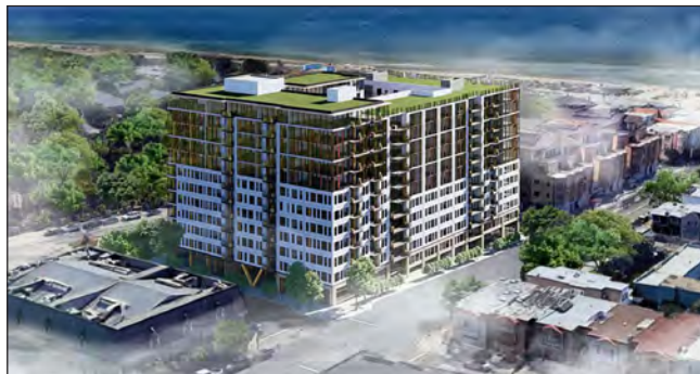
A birds eye view looking southwest showing the proposed new 12 story multi-unit building, across the street from the UCC.

Many of you will be aware of our own ambitious plan for redeveloping our facility at 45th and Wawona. Less may be known about the recently proposed multi-unit residential and retail development across the street (to the west) where the Sloat Garden Center is currently housed. The site was sold in 2020 to a developer for $8.55 million, and last month we learned that the developers propose to construct a 400-unit building reaching 12 story which will rise 125 feet in the air. While our own proposed vision for the new Irish Center reimagines it as a Community Center for the neighborhood - housing a museum, library, performing arts space, theater, swimming pool, gym, roof garden, 30 parking spots, hospitality space and office space for local non-profits - it will feature no residential housing.