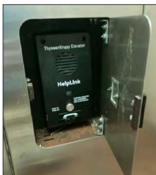
The new ADA compliant phone in the Elevator Cab Control Panel.