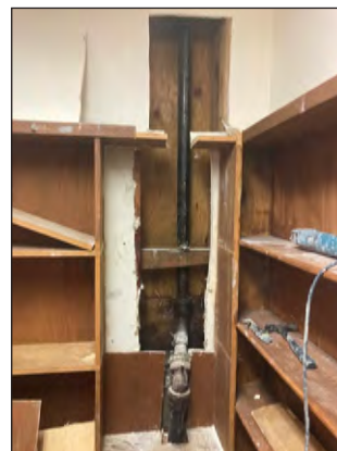
Wall on the north end of the Library had to be opened up to do the plumbing repairs.