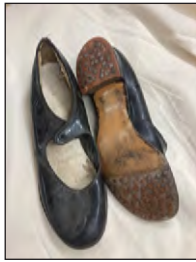
An old fashioned pair of Irish dance hard shoes with old fashioned tacks.