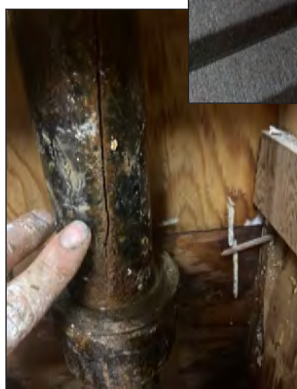
The fractured cast iron pipe on the north wall