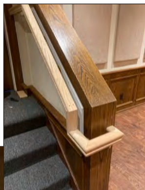
New wooden stair handrail