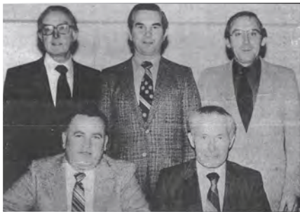
1983 RCBA Centennial Committee