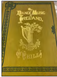
The O'Neill Book of Irish Dance Music from the early part of the 20th Century.