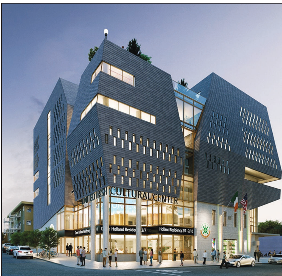
An artist's rendition of the new Irish Center as it will be seen from the corner of 45th Avenue and Wawona Street.