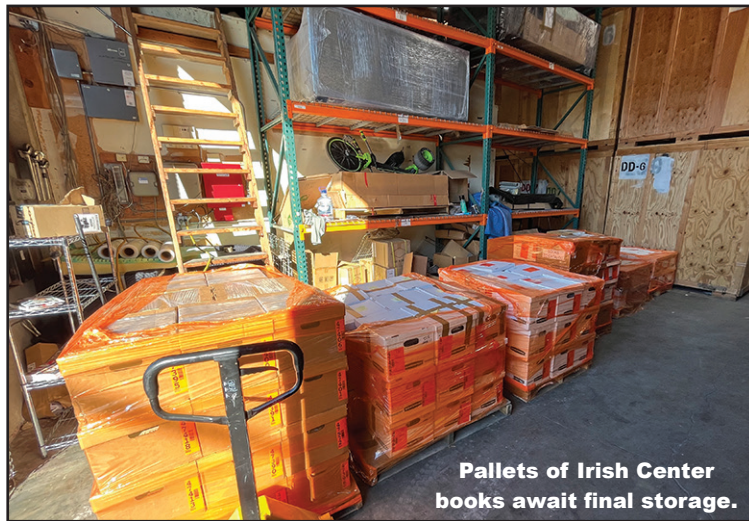
Pallets of Irish Center books await final storage.