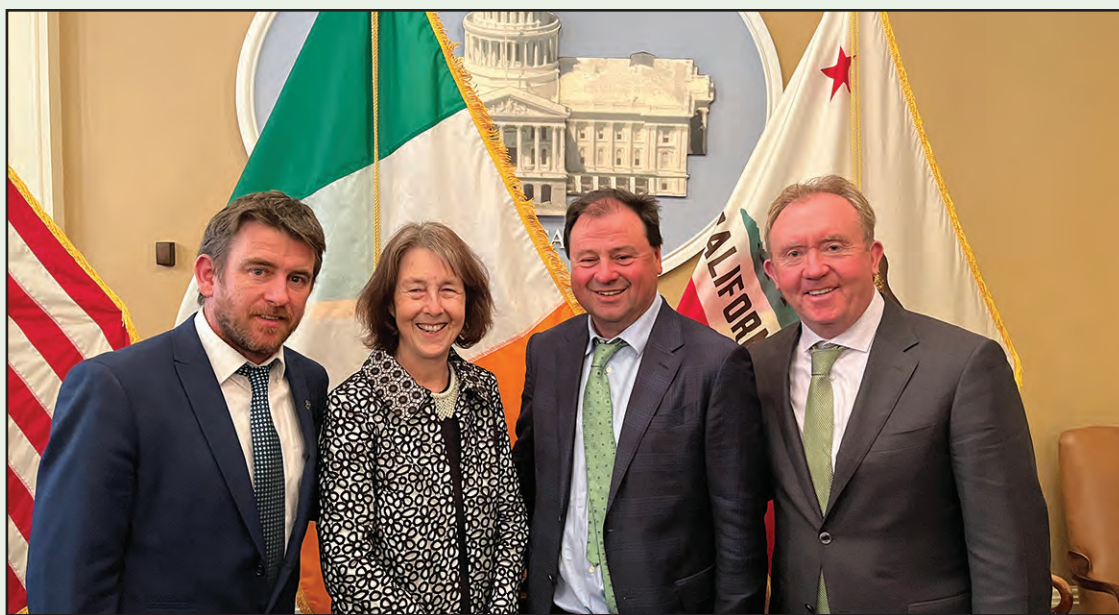
Liam Reidy, California State Senator Nancy Skinner, Redmond Lyons and Leo Cassidy at the State Capitol.

Here are some of the people with met in Room 317 in the state capitol building for a reception.